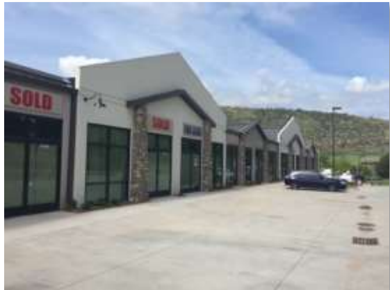
Located at 11616 Shaffer Place in the Ken Caryl Business Center

Limited Leasing Opportunities Also May Be Available