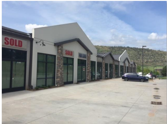
Located at 11616 Shaffer Place in the Ken Caryl Business Center